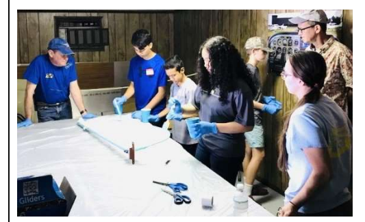
Youth Group back to hands-on fabric application for steel tube rudder "FUN"